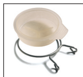
Patented anti-scale system