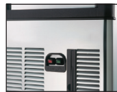
Front ON-OFF Switch