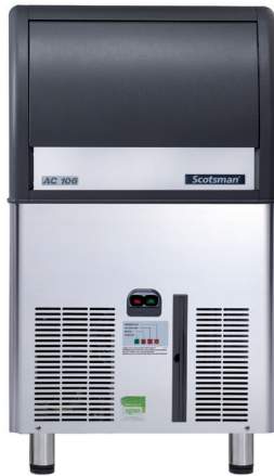
Routine Maintenance Alarm